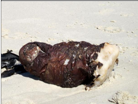
Sea Squirt (Red Bait)