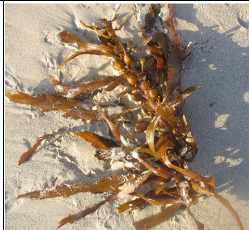
Sargassum bubble weed