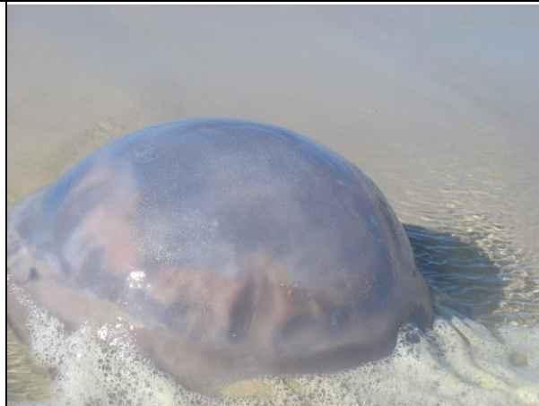
Compass Jelly fish